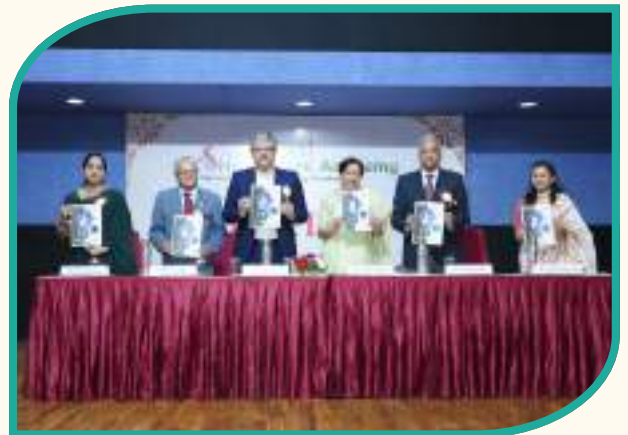
HOSPICON 2024 Souvenir Release