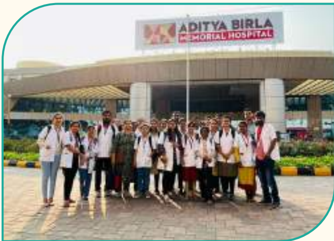
Aditya Birla Visit - Batch 2023- 24