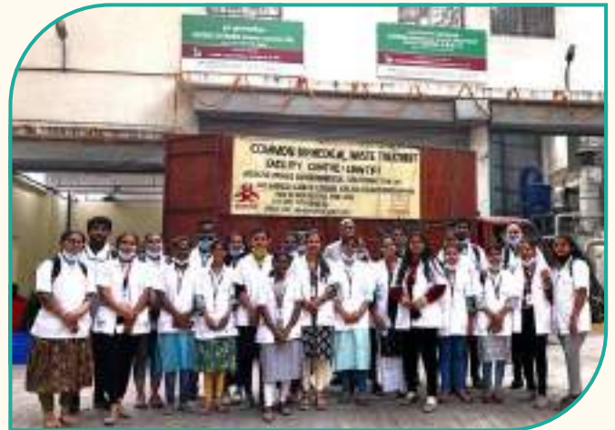
Passco Visit Batch 2023-24