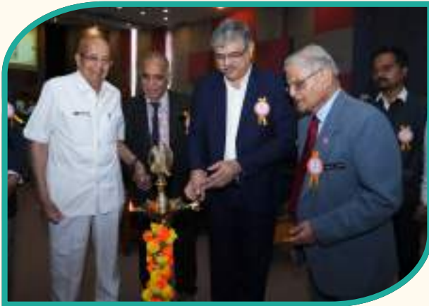
HOSPICON 2024 - Lamp Lighting