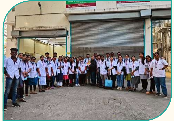
Passco Visit Batch