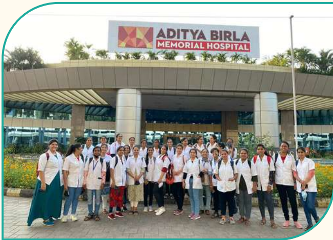
Aditya Birla Visit