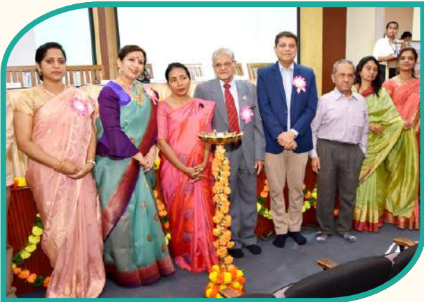
HOSPICON 2025 - Lamp Lighting