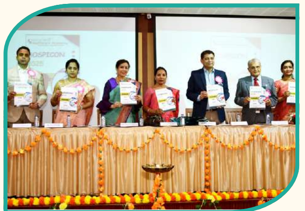
HOSPICON 2025 Souvenir Release